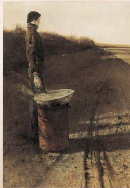
Andrew Wyeth, Roasted Chestnuts , tempera, 1956.

The Brandywine River Museum is home to one of the largest and most comprehensive collections of works by N.C., Andrew, and Jamie Wyeth, three generations of artists who embody the family's distinctive artistic legacy. Many familiar works, and many rarely on public view, are seen in regularly changing exhibitions.