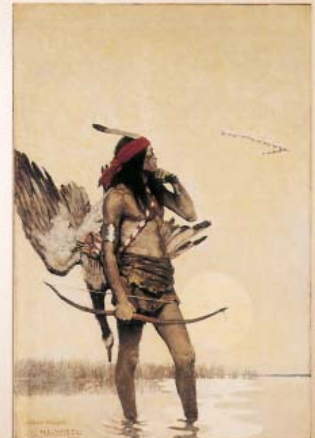
N. C. Wyeth, The Hunter , oil on canvas, 1906.

American illustration has deep roots in the Brandywine Valley, where Howard Pyle worked and taught such artists as N.C. Wyeth and Maxfield Parrish. These and other important