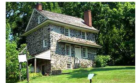
John Chads House

Today this bucolic community is known for the Wyeth family painters, equestrian farms, historic homes, Americana museums and world renowned gardens... all nestled in rolling hills along the meandering Brandywine Creek. Drive through the countryside, visit the museums and stop in for a meal at one of the many local establishments... all proud to be part of the Brandywine Valley.