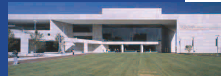
Independence Mall, Philadelphia