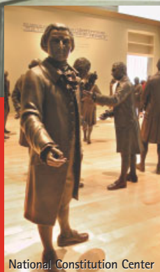
National Constitution Center